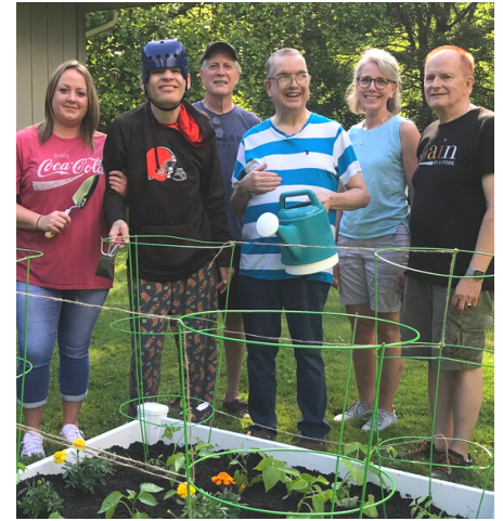
TMF received grants to construct raised Therapeutic Garden Beds at four group homes. With some help, the residents built the beds and planted gardens. The hope is to expand to other group homes in 2022.

While 2021 was challenging when bringing groups of people together safely, most of our activities and classes resumed in-person by the fourth quarter. Clients, providers and families were thrilled to participate in sports, movie night, bingo, yoga class, art class and more. The Metzenbaum Foundation is proud to serve, support and celebrate developmentally disabled individuals in our community.